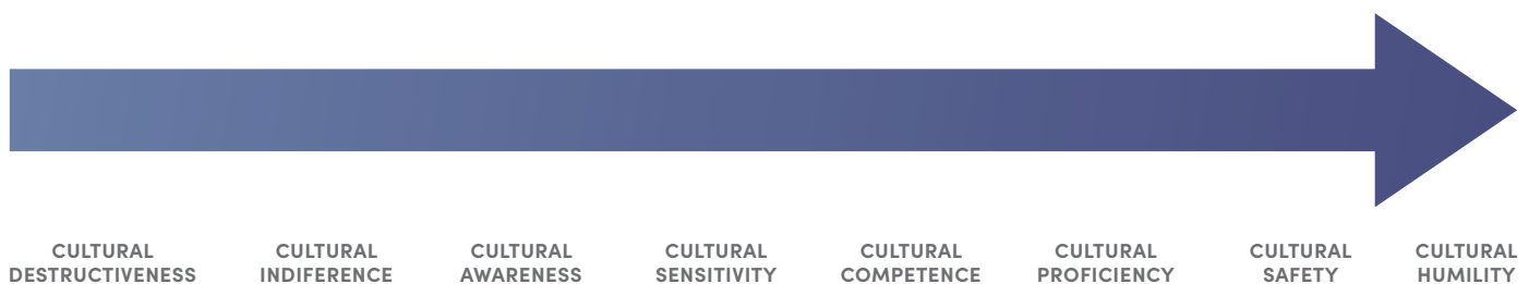
Figure 1. Cultural continuum from Rossiter et al. (2018). Domestic violence in immigrant and refugee populations: culturally informed risk and safety strategies.

It is beneficial for service providers to gain knowledge about the differing levels of cultural awareness. An effective way to do so is to see where service providers may lie on the cultural continuum shown below.